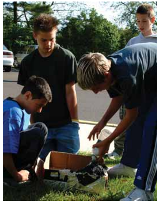
Bridge students perfect the art of recreating volcanos.

The Academy joined several professional development organizations: The Association of Schools and Agencies for the Handicapped, The National Association of Special Education Centers, The Council for Exceptional Children, and the Association for Supervision of Curriculum and Development.