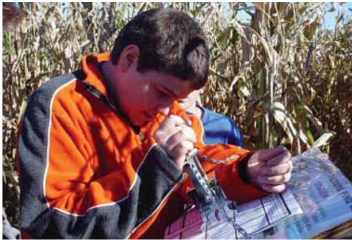
Team building and navigational skills are honed on our corn maze outing.