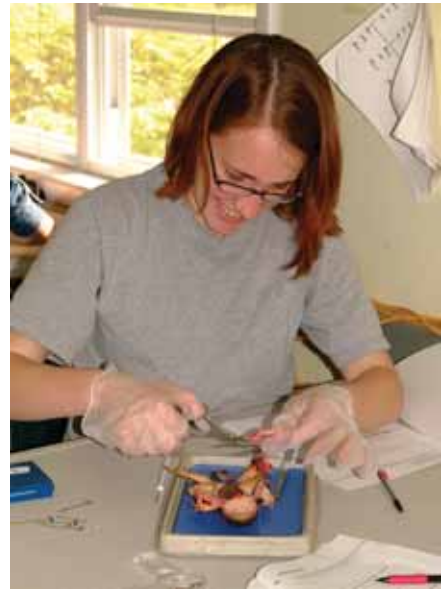
Dissection was part of the life science curriculum this year.

Beyond providing intensive remediation in language arts, our curriculum includes well-designed courses in mathematics, science, social studies, literature, art, music, physical education, health, computer applications and career orientation. Through frequent consultations, our staff tailors the program to meet each student's needs.